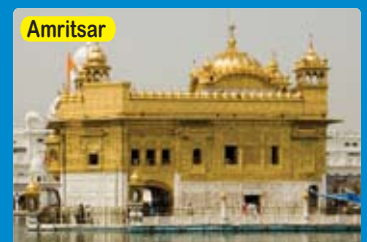
Capital of the Sikh religion & city of India's most dazzling temple