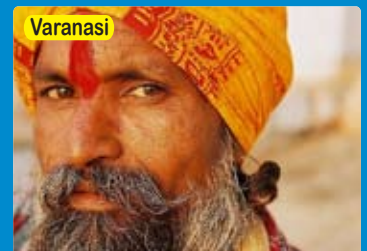
Varanasi is the oldest living city in the history of mankind