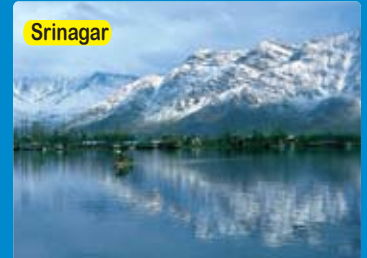
Srinagar- Queen of Kashmir valley