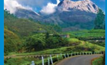
Munnar- Lost in the clouds