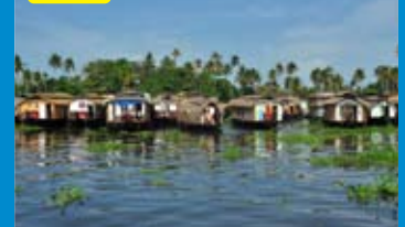
Cochin- Queen of the Arabian Sea