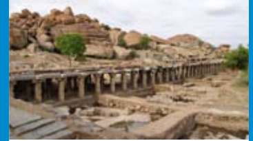
Hampi- A temple complex and World Heritage Site