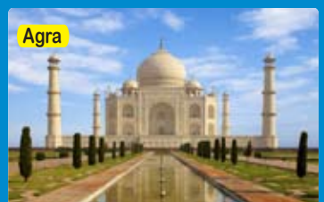
Agra- The "City of Tajmahal" often described as the most romantic place in India