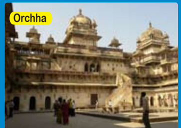
Orchha- A rich heritage of medieval times