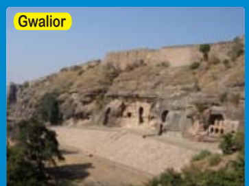
Gwalior- The city of Forts